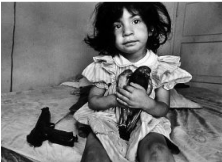
DeCesare, Donna. "Shadow Dreams and New Youth Visions." n.d. Photograph. Fifty Crows . n.p. Web. 17 Nov. 2015.