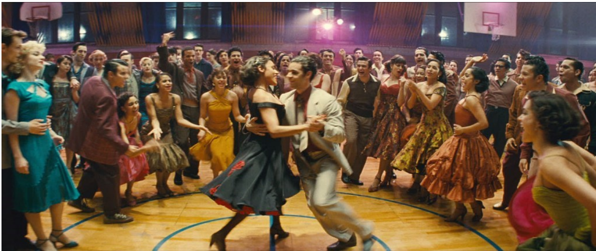
West Side Story (2021)

You will have a hard time sitting still to the extremely dance-able music of Latin USA . Check out these videos and you'll be ready to dance along.